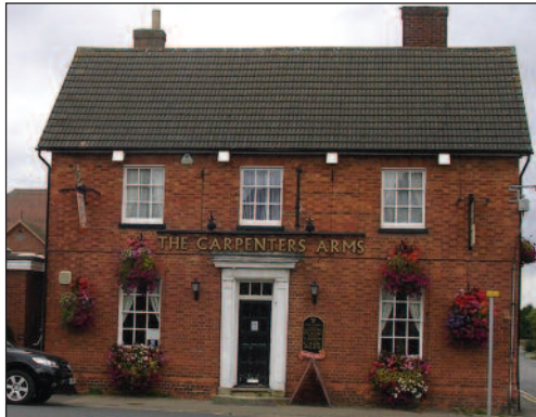
Carpenters Arms, Cranfield

Apologies both to the campaigners and to our readers for locating the White Horse in the wrong village in the Local pub campaigns feature in our last issue. While the Five Bells campaign is in Riseley, the White Horse is of course in Keysoe .