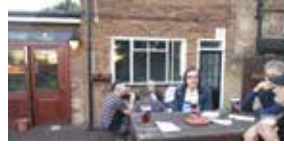
Only keg beer at the Duke!

attractive pub, originally Wells, that had been closed for a while and reopened just before the lockdowns. After that we walked to the other end of the town centre to visit the King William IV in the High Street – the other Wells pub nearby, the Half Moon, was one of the casualties of the pandemic and didn't