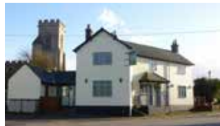
March Hare, Dunton

In the event, the representatives of all three